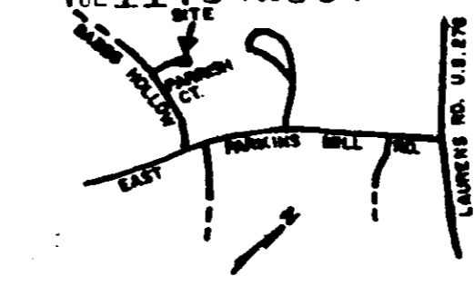
LOCATION MAP N/S